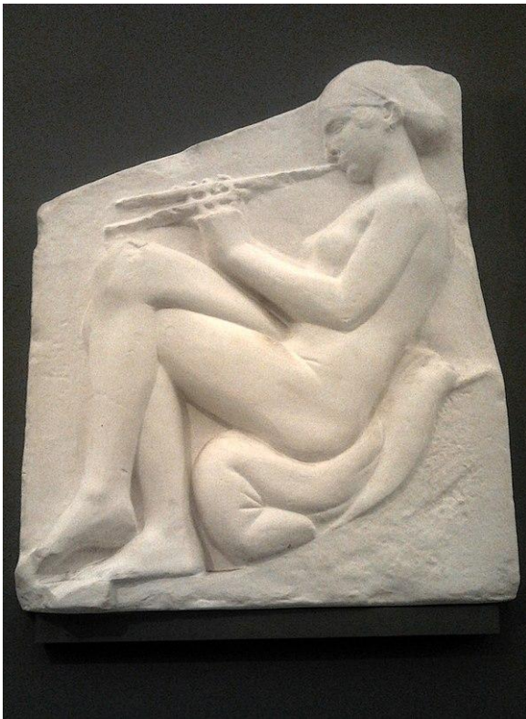
Left-hand panel: a naked woman playing the aulos