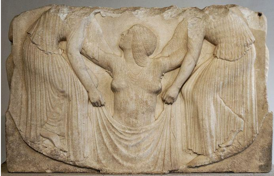
Main panel: "Aphrodite rising from the sea".